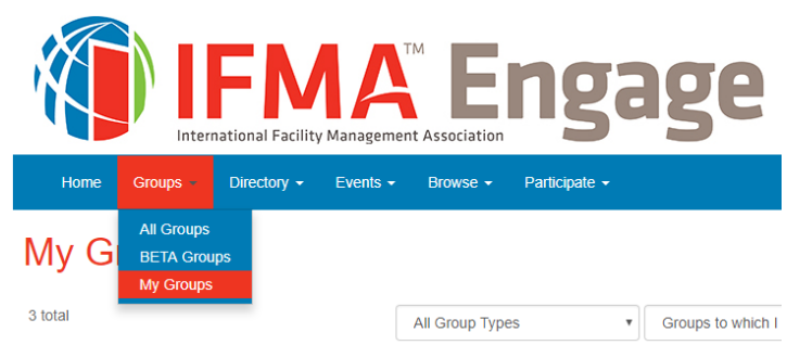
Academic Facility Council

Please take a moment to check it out and give your Board feedback. If you need assistance you can email me at gary.rudkin@corix.com.