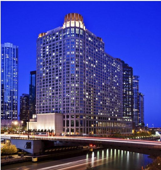
Sheraton Grand Chicago

This one-of-a-kind™ event draws a unique group of FM leaders and decision makers who are investing in education, networking, and products and services that will help them maintain their competitive edge in an ever-changing industry. With The IFMA Hub, the Career Resource Center and FM Mentors, and the Emerging Technology Showcase, the Facility Fusion expo has become an immersive experience that focuses on attendee engagement.