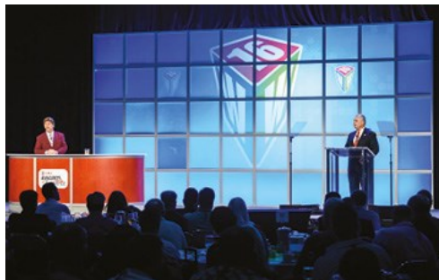
World Workplace 2016, San Diego, California.