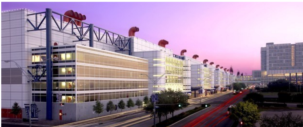
George R. Brown Convention Center, Houston, TX.

The most all-encompassing learning and networking event on facilities and how to manage them. Immerse yourself in all things FM — from groundbreaking discoveries impacting the industry, to achievable strategies for your daily to-do list.