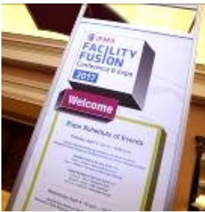
Facility Fusion 2017, Las Vegas, NV.

Pictures, highlights and more from Facility Fusion 2017 which took place in Las Vegas, Nevada from the 4th to the 6th of April in Caesar's Palace.