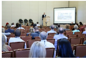
Facility Fusion 2017, Las Vegas, NV.