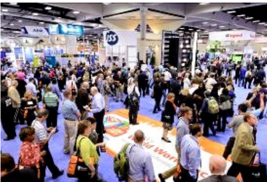
World Workplace 2016, San Diego, California.

The most all-encompassing learning and networking event on facilities and how to manage them. Immerse yourself in all things FM — from groundbreaking discoveries impacting the industry, to achievable strategies for your daily to-do list.