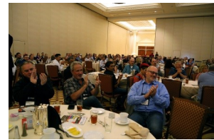
Facility Fusion 2017, Las Vegas, NV.